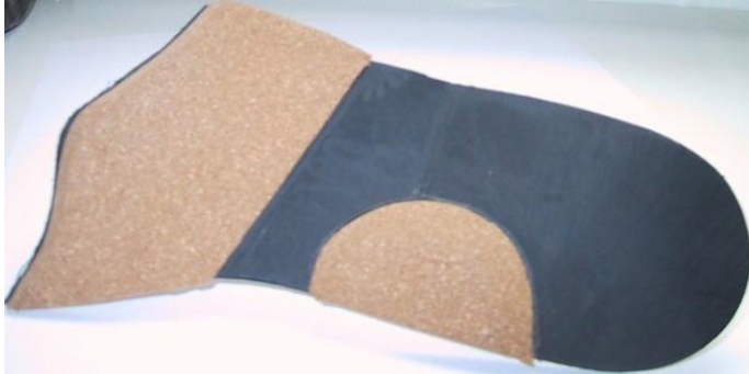
Bourdiol (not covered)

It was Bourdiol's hypothesis that such an insert, placed under the medial arch, stimulates directly the nuclear chain- and bagspindle of the m. abductor hallucis which leads consequently to a contraction of this muscle, activated by the \alpha -motorneuron..